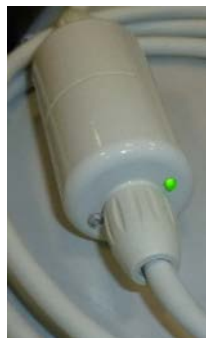
Figure 1 Green LED indication of function

In the course of post market surveillance activities it has been observed that the Connection Leads are potentially affected by a malfunction which has a correlation to massive temperature fluctuations. The malfunction can be observed as the connection lead has no power output, thus not charging the pump. This failure can be easily detected by observing the LED indication of the Connection Lead which signs the cable is functional or not.