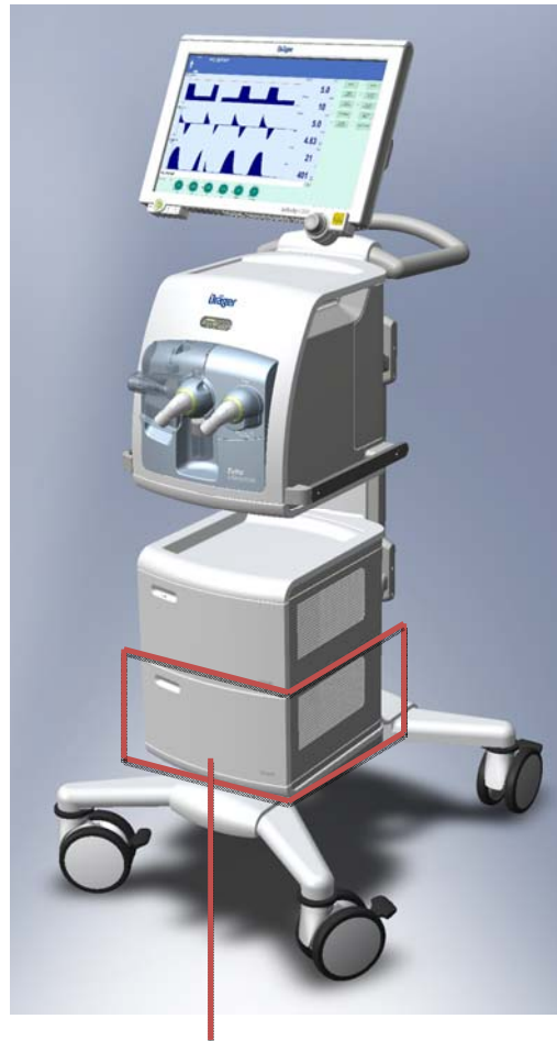
optional PS500 – Power supply unit