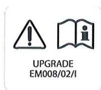
Label 1 (SV300)

Ventilators, within the above specified serial number range, that are marked with one of the following labels on the inside of the lid of the pneumatic unit are exempted since they have already been fitted with a new type of the pressure transducer: