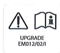
Label 2 (SV900)