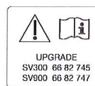
Label 3 (SV300/SV900)

In addition, SV300 units with S/N higher than 24999 and SV900 units with S/N higher than 188499 are already equipped with the new type of pressure transducer.